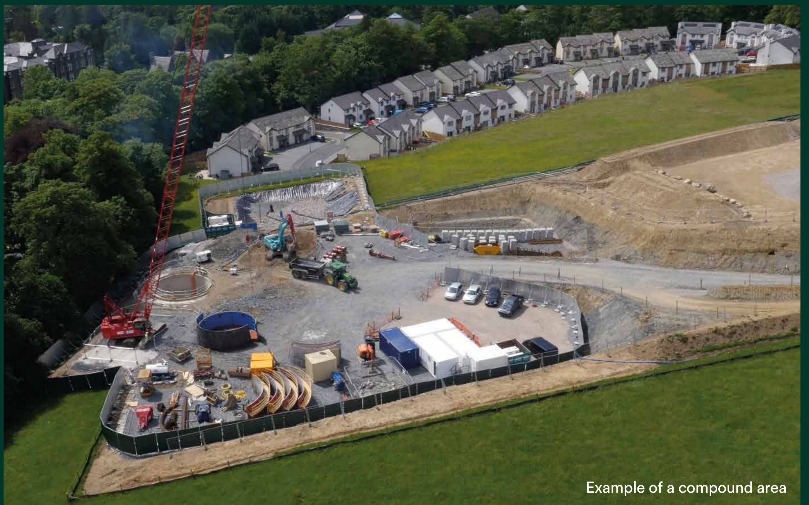
Example of a compound area