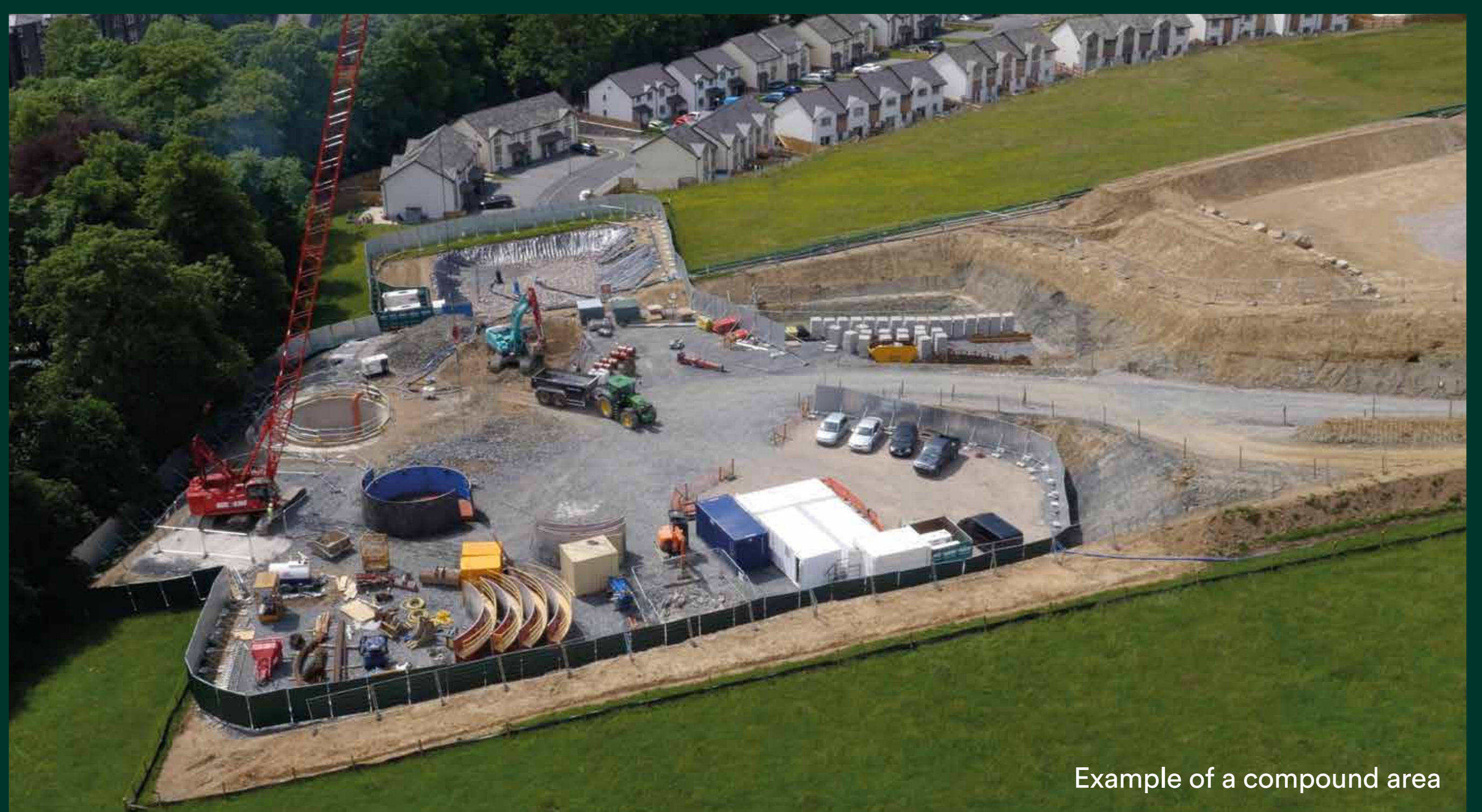
Example of a compound area